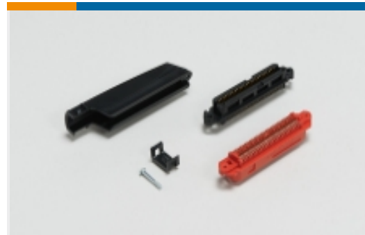
IDC D-Sub Connectors(6)